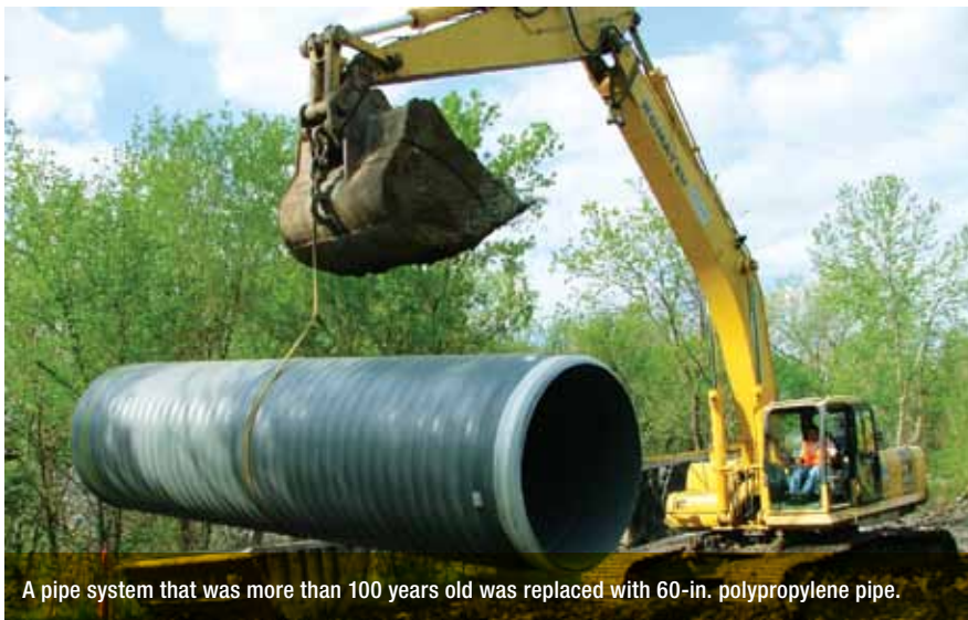
A pipe system that was more than 100 years old was replaced with 60-in. polypropylene pipe.

"The whole project was about replacing the old brick arch sewer that was